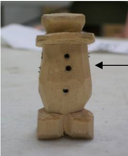
When little people go bad.