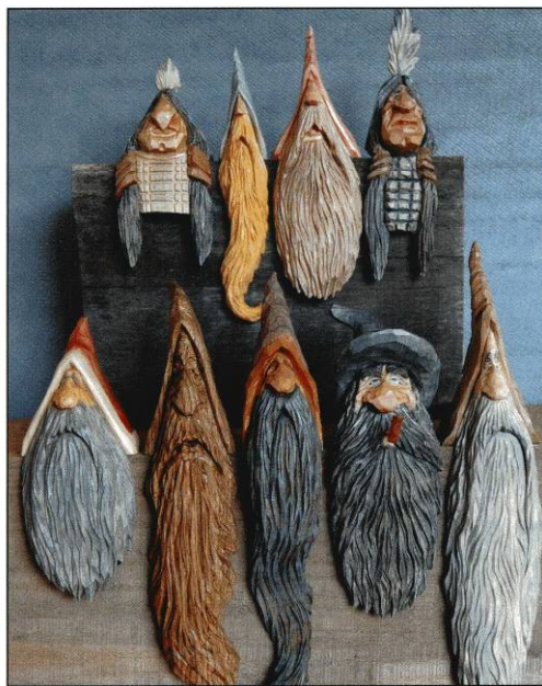
The Shelf Elf Gallery